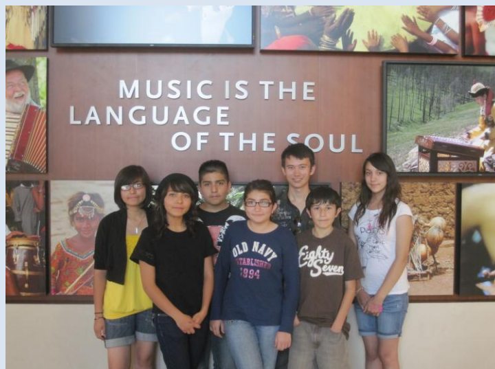
Students at the Musical Instrument Museum after the Kronos Quartet Dress Rehearsal