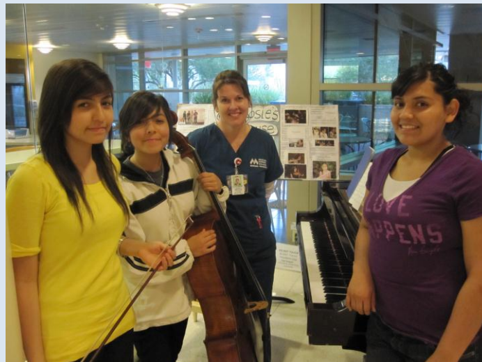
Students perform at Banner Good Samaritan Hospital