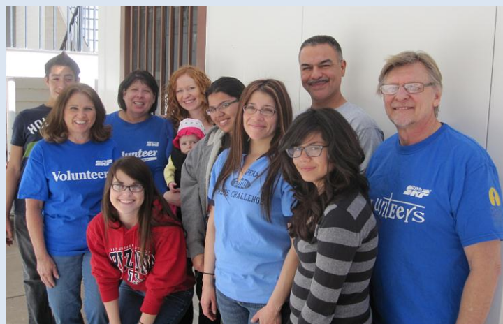
SRP Volunteers on campus for Instrument Inventory Project